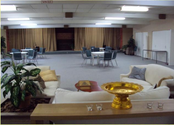
Unity Reception Hall

5840 Oak Street. Vancouver BC. V6M 2V9. C: 604-312-8336 E: unityofvancouverrentals@gmail.com . unityofvancouver.org