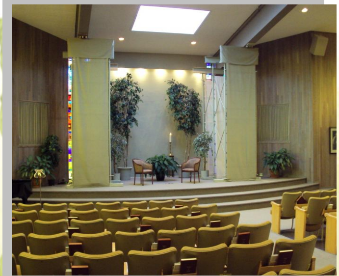
Unity Sanctuary & Auditorium

Your staff and guests will find plenty of free parking on the property and on the adjacent streets. Centrally located near 41 st and Oak Street on major bus routes and steps to the Canada Line, Unity of Vancouver is easy to find and conveniently accessible by transit.