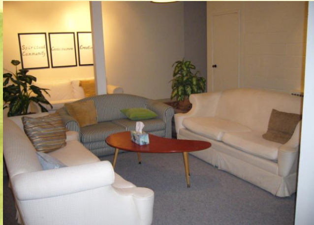
Unity Art gallery & Lobby