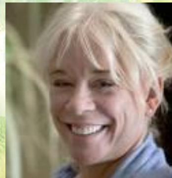
Gangaji (presented by HollyHock)